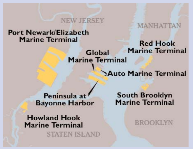
CPIP Plan and EIS Port Sites

The volume of cargo that passes through the Port of New York and New Jersey is projected to double in the next 20 years. Plans are being made today to provide an economically viable, environmentally sustainable port for tomorrow. The Comprehensive Port Improvement Plan (CPIP) consisting of the Plan (CPIP Plan) and an Environmental Impact Statement (CPIP EIS) will identify improvements to the Port's cargo-handling capacity and related transportation improvements to meet future demand through the year 2060.