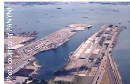
Green Port Development