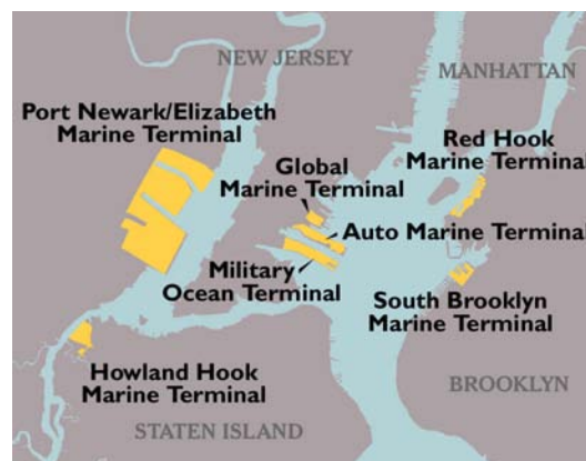
Major New York-New Jersey Port Facilities

EIS, public input will help shape the study areas to make sure that all potential CPIP-related benefits and impacts are identified and evaluated.