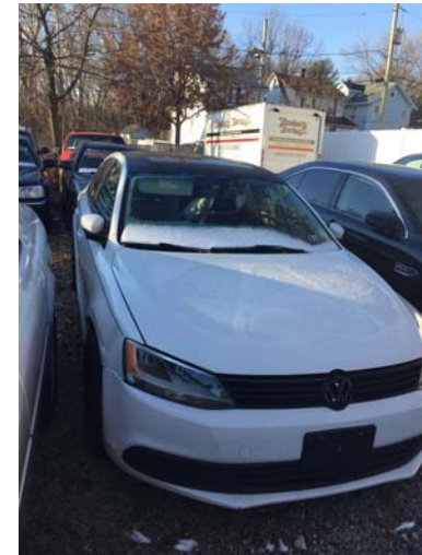
2011 VOLKSWAGEN JETTA