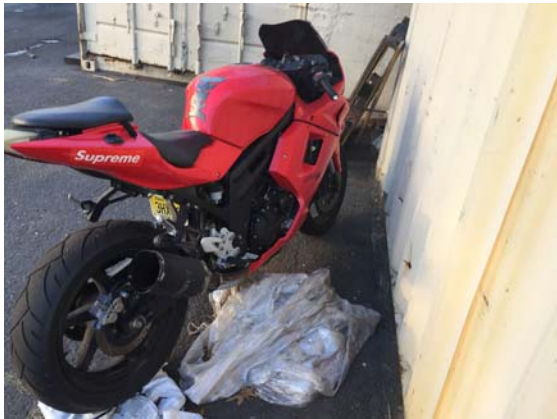
2011 HYOSUNG GT350