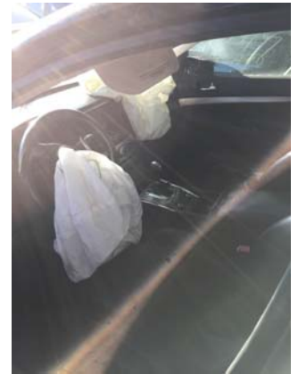
2013 INFINITI G37