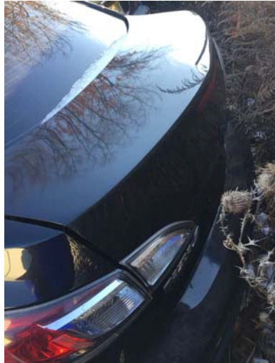
2011 MAZDA 3