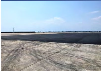
New Pavement on Hanger 12