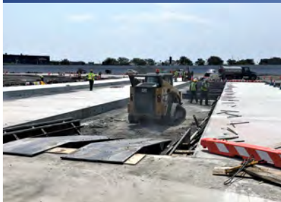
Concrete Slab Replacement at Taxiway UA