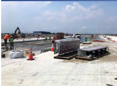
High Speed Taxiway WW