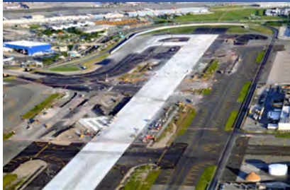
Construction Progress - Aerial Photo