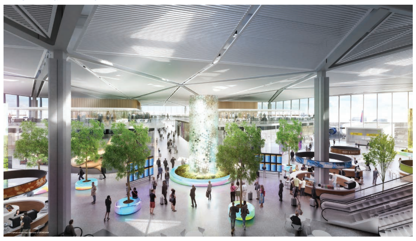
Located in a new site on the airport property, the new Terminal One eventually will replace the existing Terminal A, the airport's oldest terminal.

international and 10 domestic gates. In 2019, the Port Authority Board of Commissioners authorized $35 million for vision and master planning initiatives that would allow for the future replacement of Terminal B with a new world-class Terminal Two.