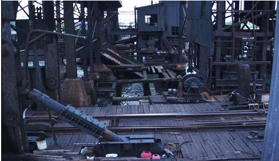
Cross Harbor Freight Program