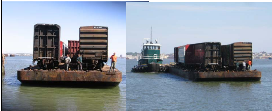
Cross Harbor Freight Program