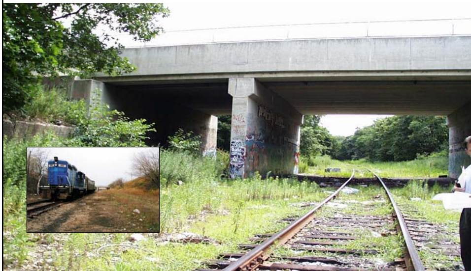
Cross Harbor Freight Program