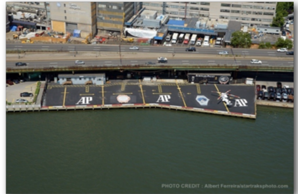
East 34th Street [6N5]