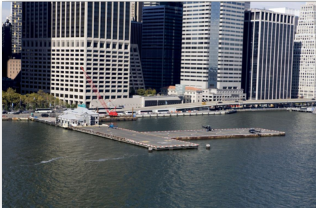
Downtown Manhattan [JRB]