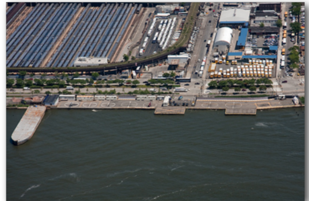
West 30th Street [JRA]