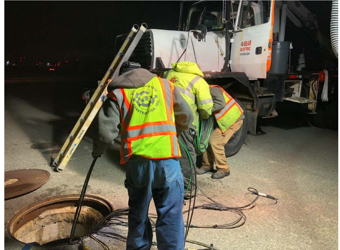
Removal of Cables