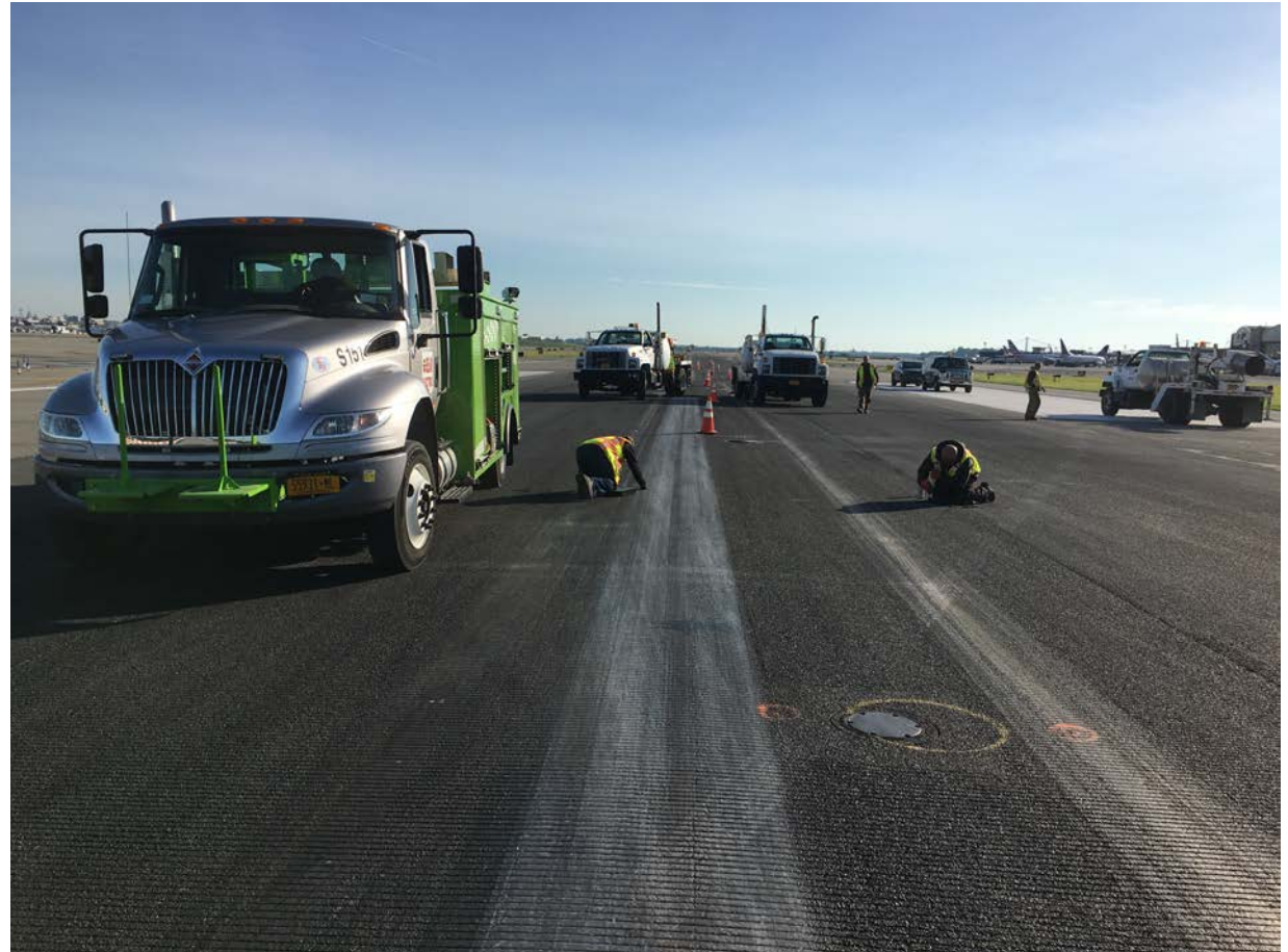
Removal of FAA Runway Status Lights