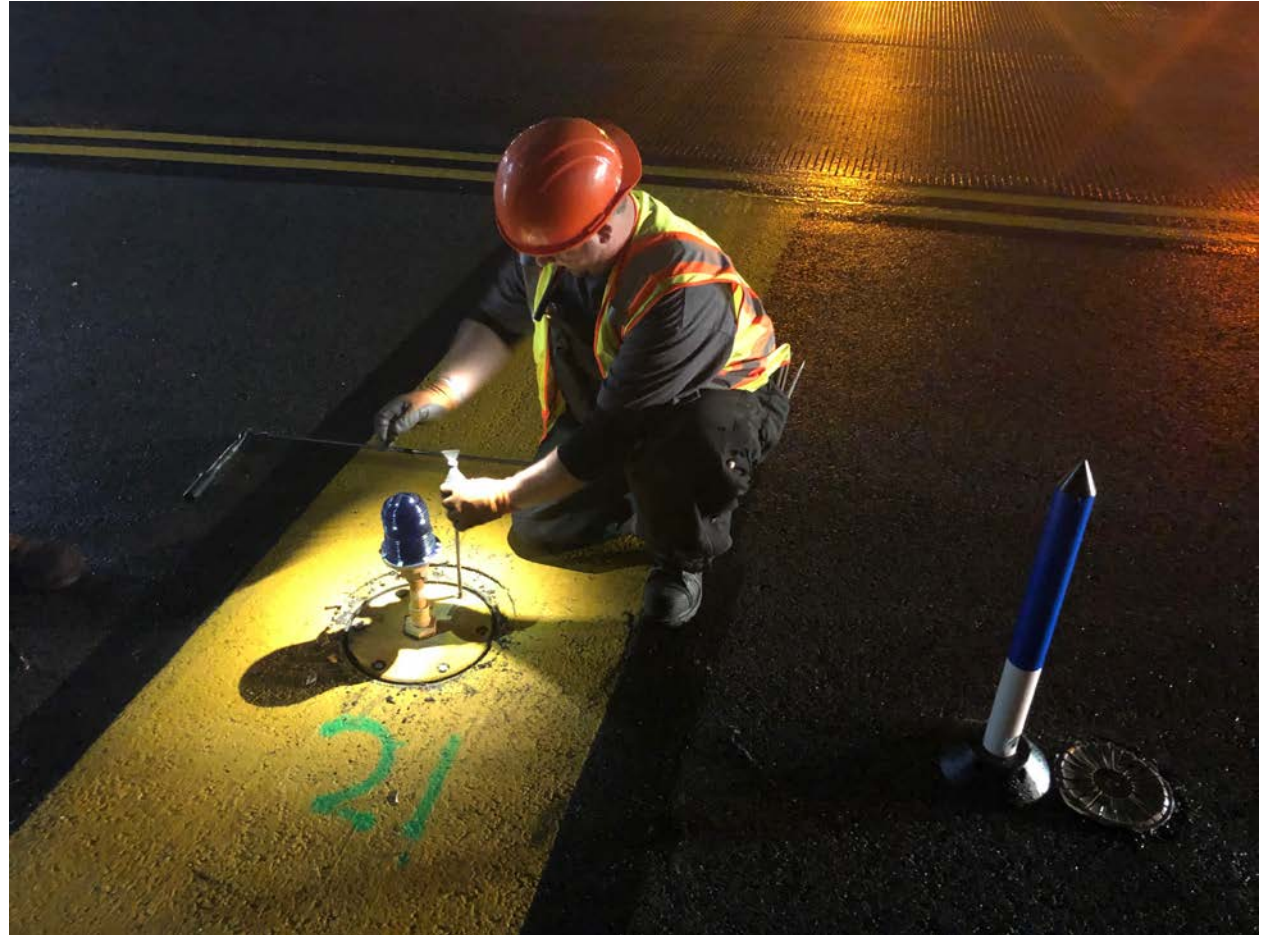
Removal of Runway Edge Lights