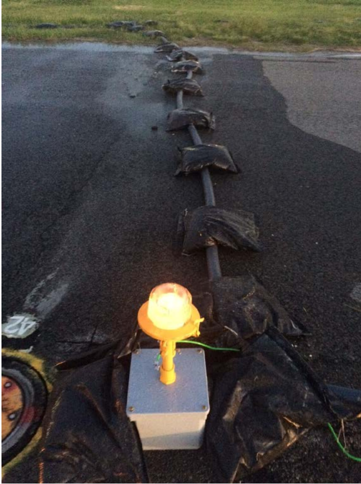
Temporary Runway Edge Light