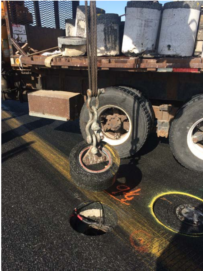
Removal of Light Base