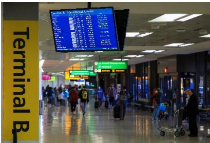
Terminal B Level 2