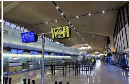
Terminal B Level 3